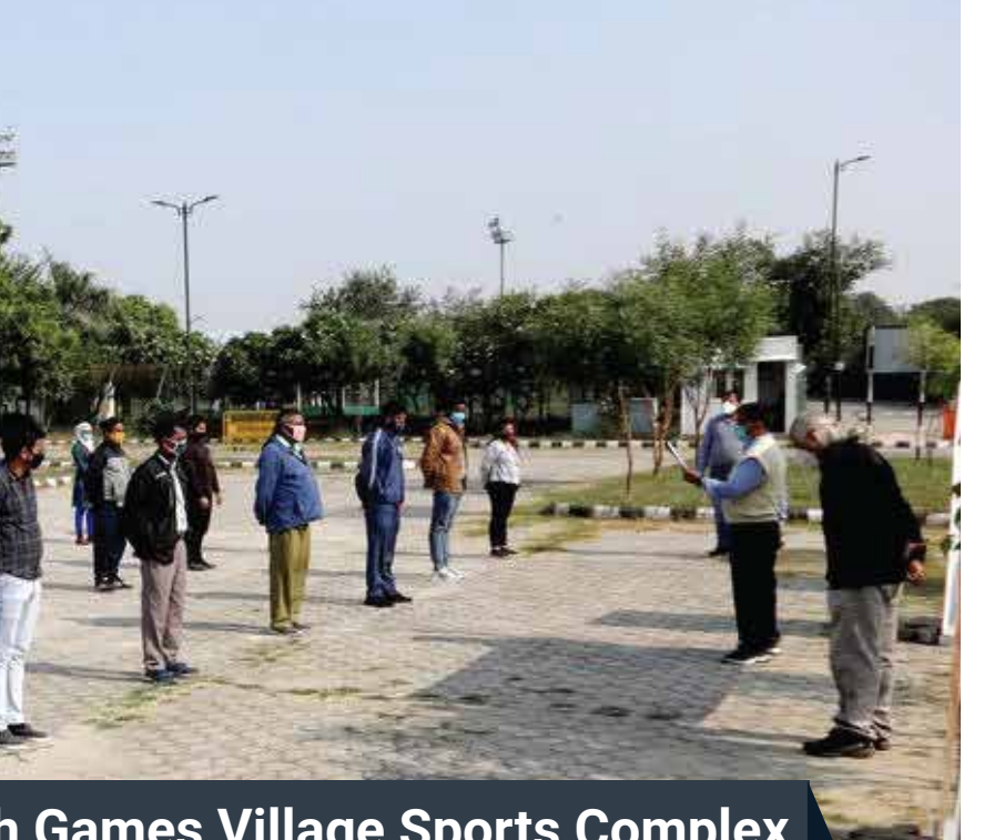
Common Wealth Games Village Sports Complex