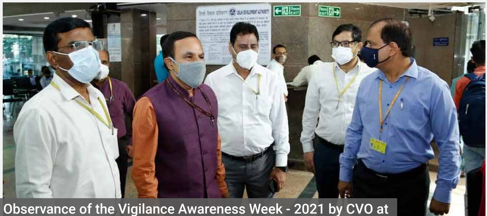
DDA HQ, Vikas Sadan.