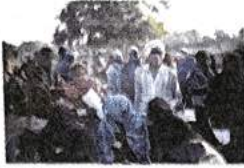
The decision was passed in a 2018 plea moved by the residents.

A single judge bench of Justice Gaurang Kanth passed the decision in a 2018 plea moved by Bela Estate Mazdoor Basti Samiti, who claimed that the estate is a large JJ