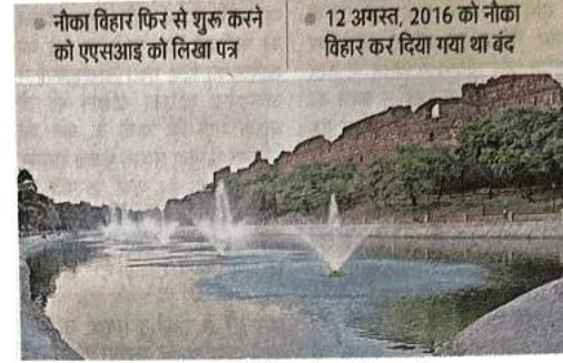
पुराने किले में स्थित झील, जिसमें पहले होता था नौकायन

राज्य ब्यूरो, नई दिल्ली : पर्यटन को दृष्टि से महत्वपूर्ण पुराना किला में फिर से नाव चल सकती है। पर्यटक यहाँ नौकायन कर सकते हैं, हालांकि यह तभी संभव हो सकेगा जब इसके लिए भारतीय पुरातत्व सर्वेक्षण (एएसआइ) अनुमति देगा। दिल्ली सरकार ने एएसआइ से पुराना किला झील में नौका विहार को फिर से शुरू करने की अनुमति देने का आग्रह किया है और कहा है कि इससे जी20 प्रतिनिधियों के दौर के दौरान राजधानी में आकर्षण बढ़ेगा। 12 अगस्त 2016 को पुराना किला में नौका विहार बंद कर दिया गया था। डीटीडीडीसी (दिल्ली पर्यटन एवं परिवहन विकास निगम) के एक अधिकारी ने कहा कि दिल्ली पर्यटन विभाग ने 1991 में पुराना