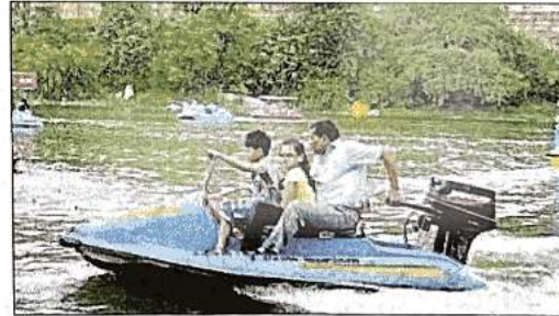
दिल्ली के पुराने किले की झील में बोटिंग करते पर्यटक

इस संबंध में सोमवार को एक अधिकारी ने बताया कि दिल्ली पर्यटन विभाग ने 1991 से पुराना किला झील में मनोरंजक नौका विहार की व्यवस्था की थी, हालांकि एएसआइ के साथ पर्यटन विभाग का समझौता 2016 में समाप्त होने के बाद नौका विहार को निलंबित कर दिया गया था। प्राचीन इंद्रप्रस्थ शहर स्थल पर स्थित पुराना किला में लगभग दो किलोमीटर का