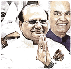
L-G Vinai Kumar Saxena

A graphic posted by Mr. Saxena showed that the total