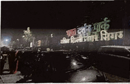
अभी भारत दर्शन पार्क के बाहर अक्सर लंबा जाम लग जाता है