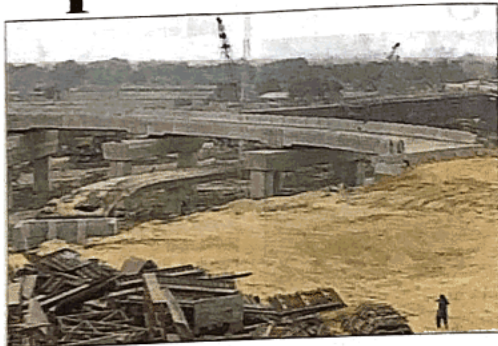
A large part of the project has been completed, but the construction work on a 700m-long stretch is yet to start.

A large part of the project has been completed, but the construction work on a 700m-long stretch is yet to start due to the land acquisition dispute.