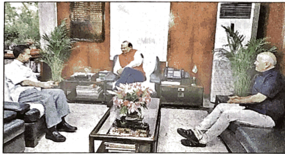
LG VK Saxena with CM Kejriwal and deputy CM Sisodia

In a statement, Raj Niwas said Kejriwal seconded the