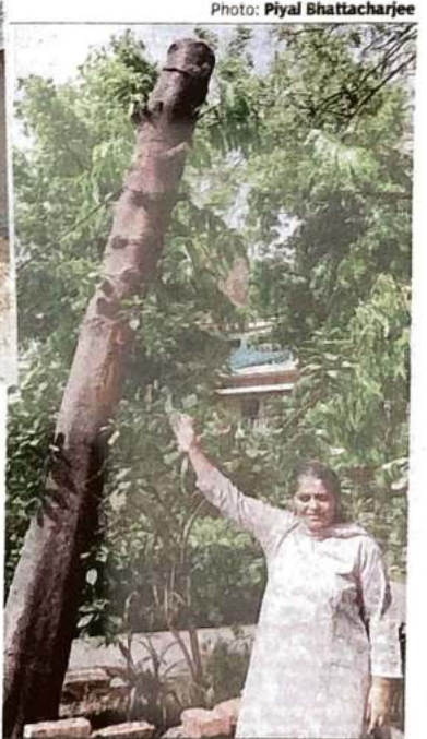
Two old Ashok trees that got knocked down, but had their roots intact were salvaged by a resident of Lajpat Nagar