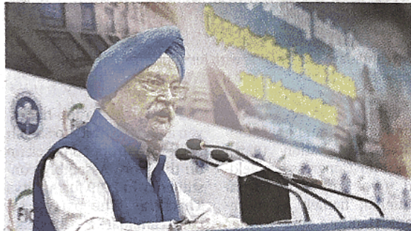
Union Minister Hardeep Singh Puri had announced the proposed amendments on March 8 this year. ■ FILE PHOTO

The amendments, if passed, would make pooling of land mandatory even for those land owners who have not expressed their interest in the scheme if the minimum participation of 70% is achieved in a sector. The amendments also propose granting of powers to the Centre to declare pooling of land mandatory even if the