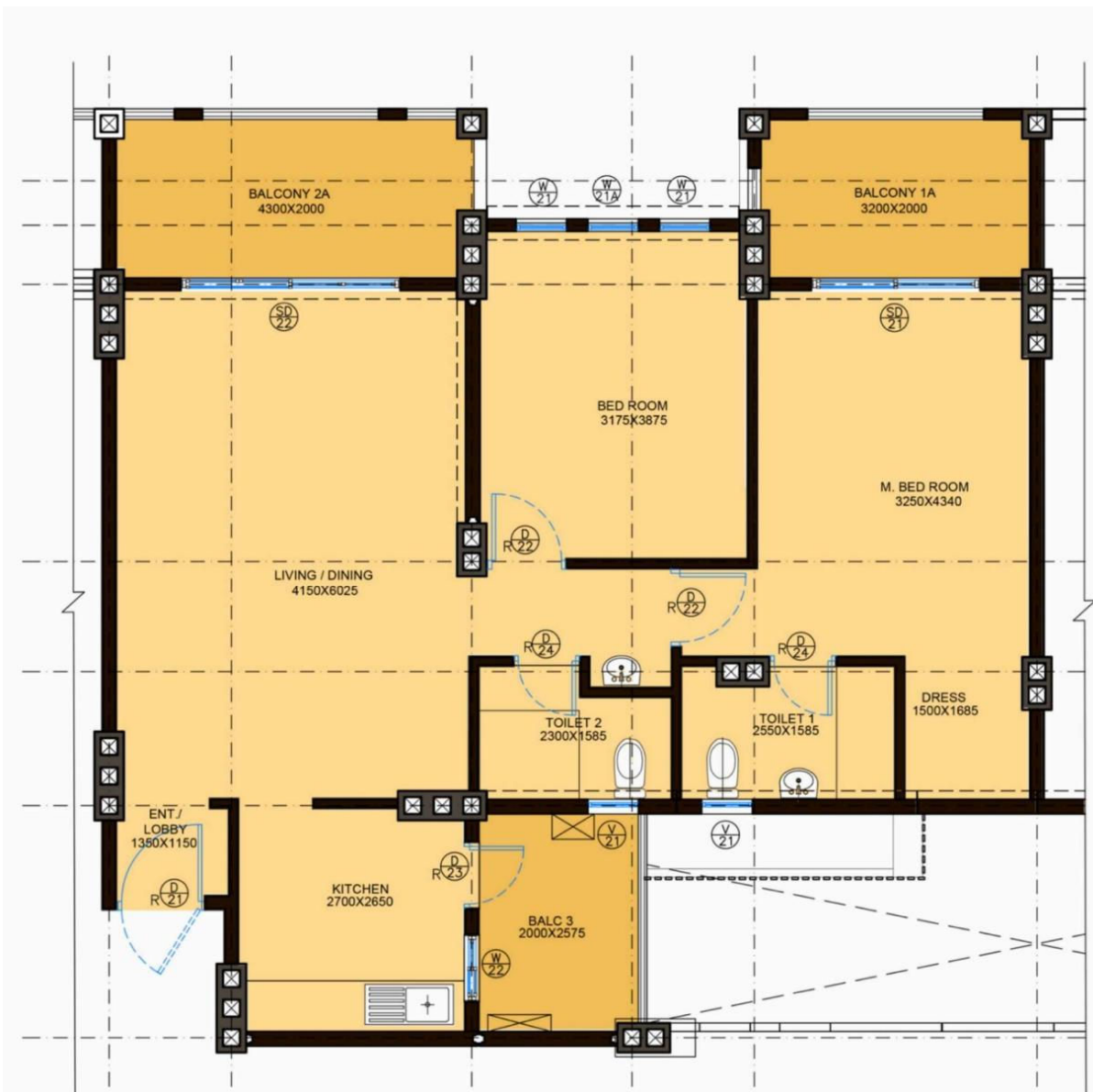
2BHK UNIT TYPE -02 CARPET AREA UNIT= 73.938 SQM