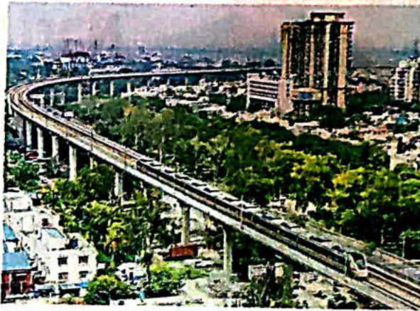
On track: Areas within 500 metres of metro lines, RRTS corridors and railway stations will be opened for development. FILE PHOTO

A total of 207 sq km in Delhi has been identified for TOD. Of this, around 80 sq km, including areas identified for land pooling, low-density residential zones, and unauthorised