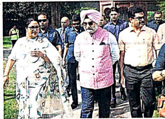
CM Rekha Gupta and L-G Taranjit Singh Sandhu inspecting ongoing works at Vasudev Ghat on Wednesday.

Officials at the site presented an overview of the floodplain restoration projects and phased develop-