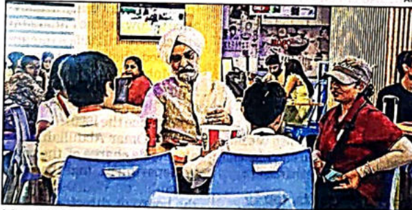
LG Taranjit Singh Sandhu at an eatery on Wednesday, during his visit to review major ongoing and upcoming DDA projects across Dwarka

Sandhu also inspected the golf course at Sector-24. Designed as a pay-and-play, international-quality sporting destination, the project aims to promote sports culture and nurture young golfers.