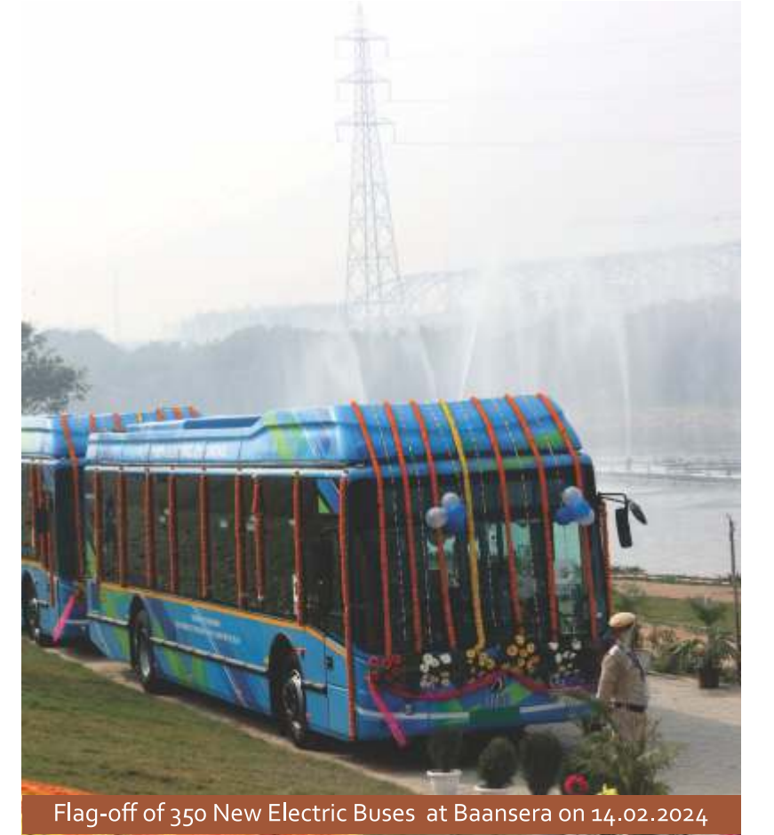
Flag-off of 350 New Electric Buses at Baansera on 14.02.2024