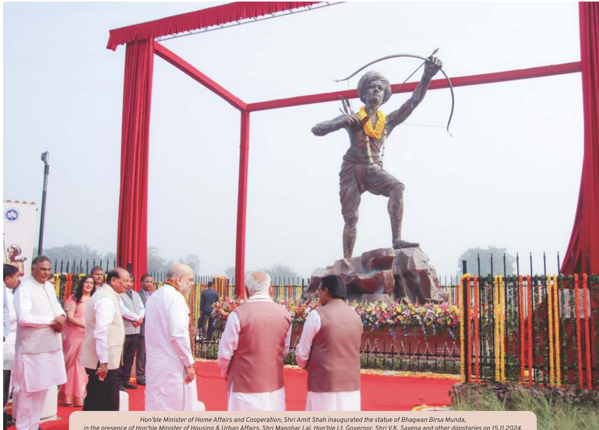
Hon'ble Minister of Home Affairs and Cooperation, Shri Amit Shah inaugurated the statue of Bhagwan Birsa Munda, in the presence of Hon'ble Minister of Housing & Urban Affairs, Shri Manohar Lal, Hon'ble Lt. Governor, Shri V.K. Saxena and other dignitaries on 15.11.2024.

This majestic 20 ft tall metal statue of Bhagwan Birsa Munda was installed at the entrance of Baansera on the Ring Road on 15th November 2024, which marked the 150th birth anniversary of the legendary tribal leader. Bhagwan Birsa Munda is a towering personification of India's indomitable cultural ethos and national spirit.