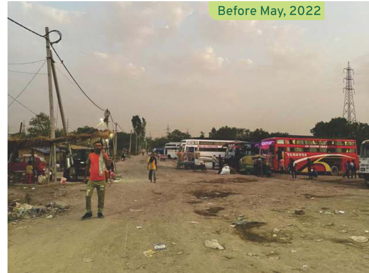
Before May, 2022