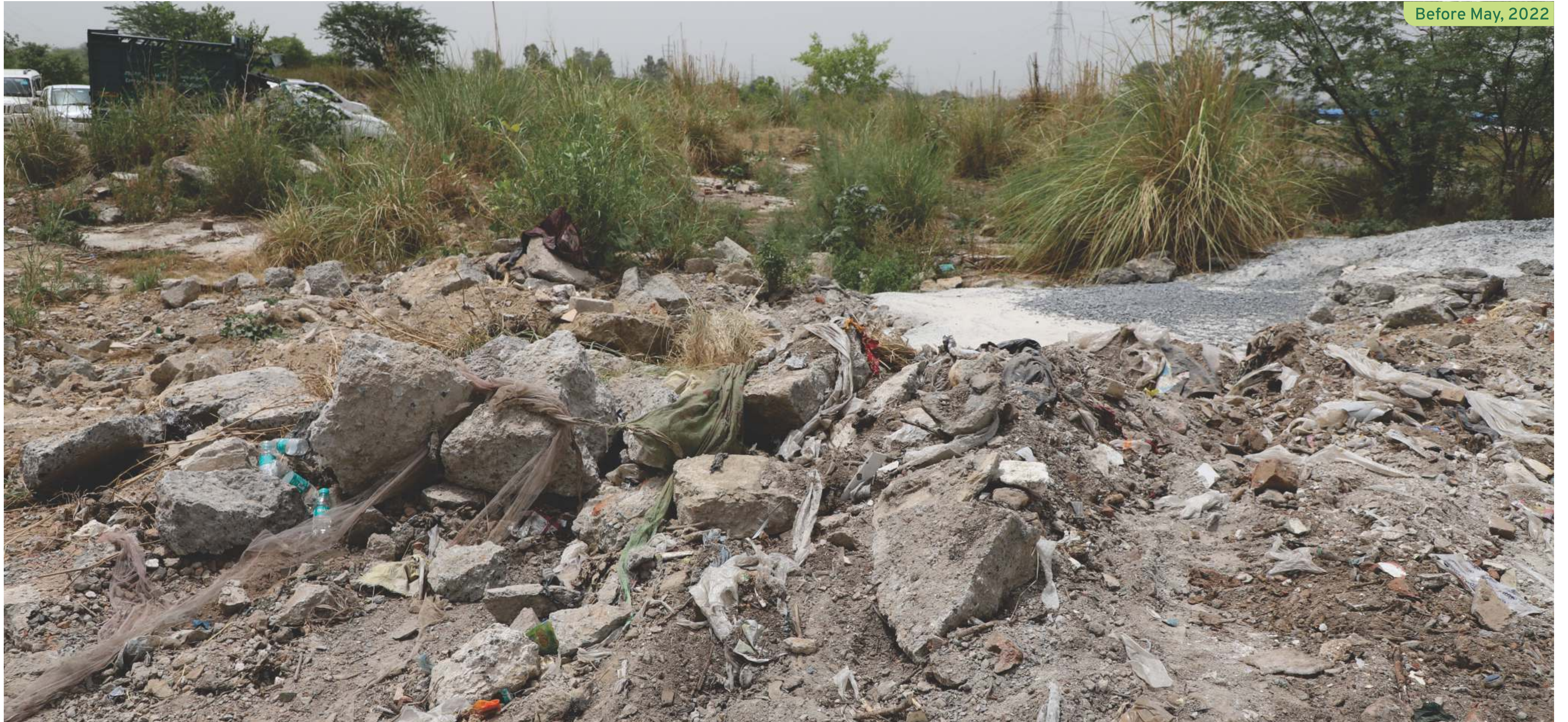
Before May, 2022