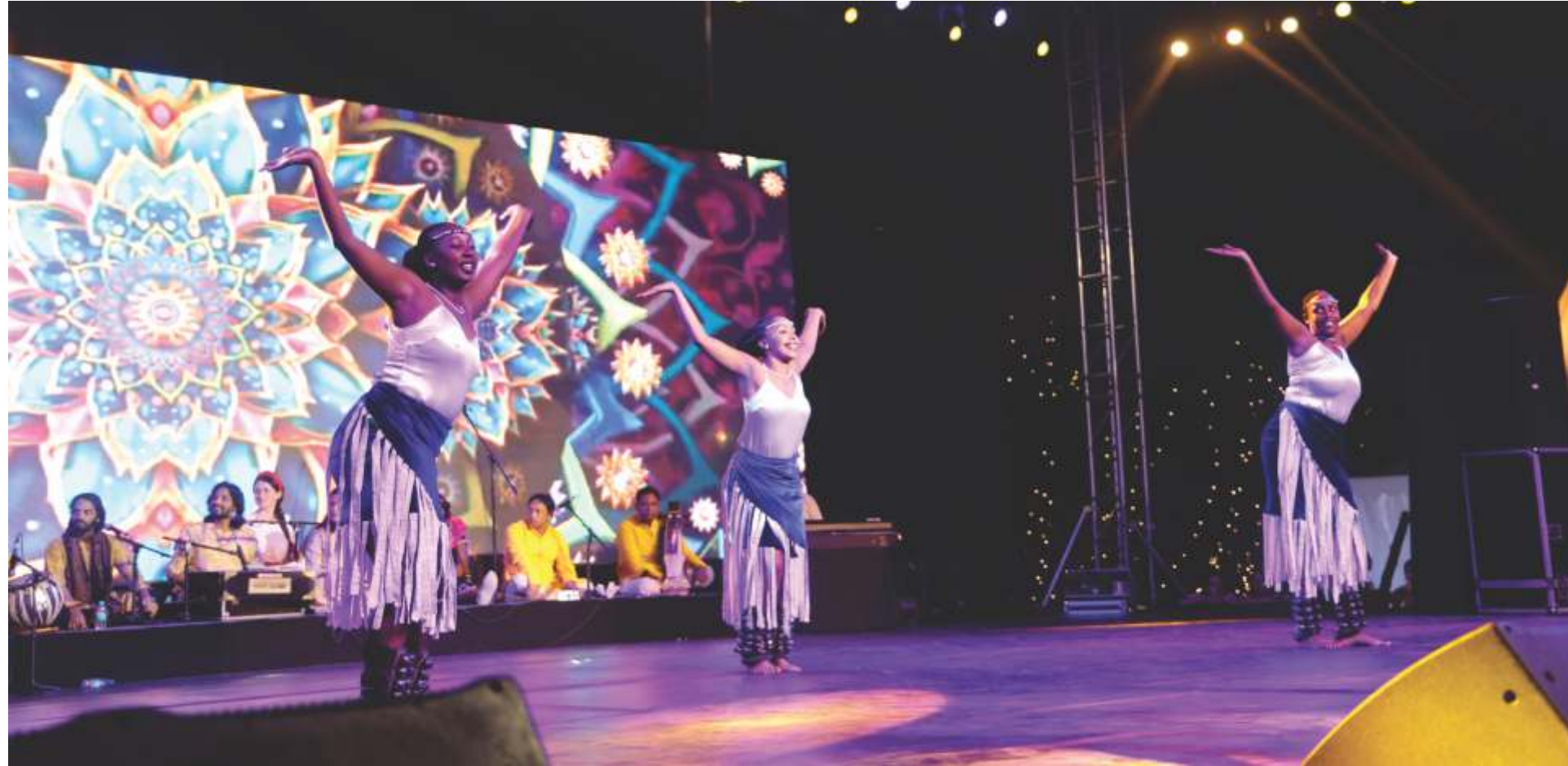
10 th Indian-International Dance and Music Festival organised jointly by DDA & ICCR at Baansera on 27.02.2025