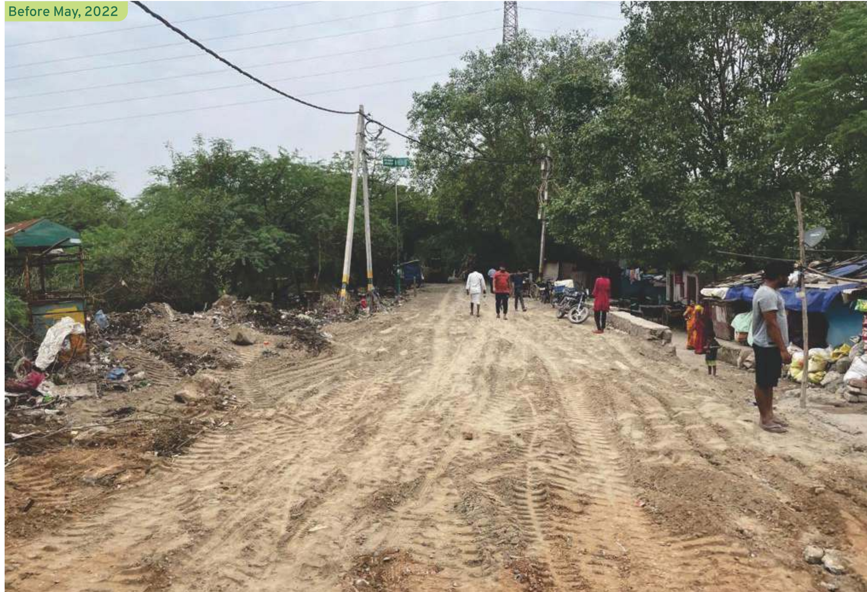
Before May, 2022