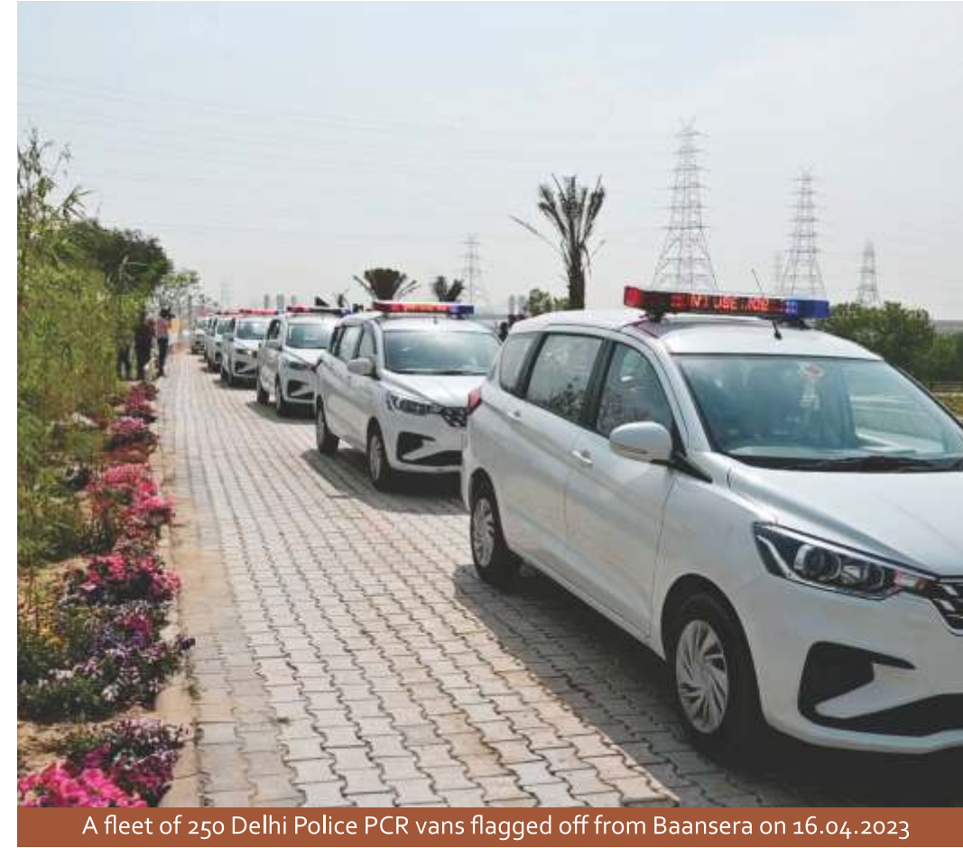
A fleet of 250 Delhi Police PCR vans flagged off from Baansera on 16.04.2023