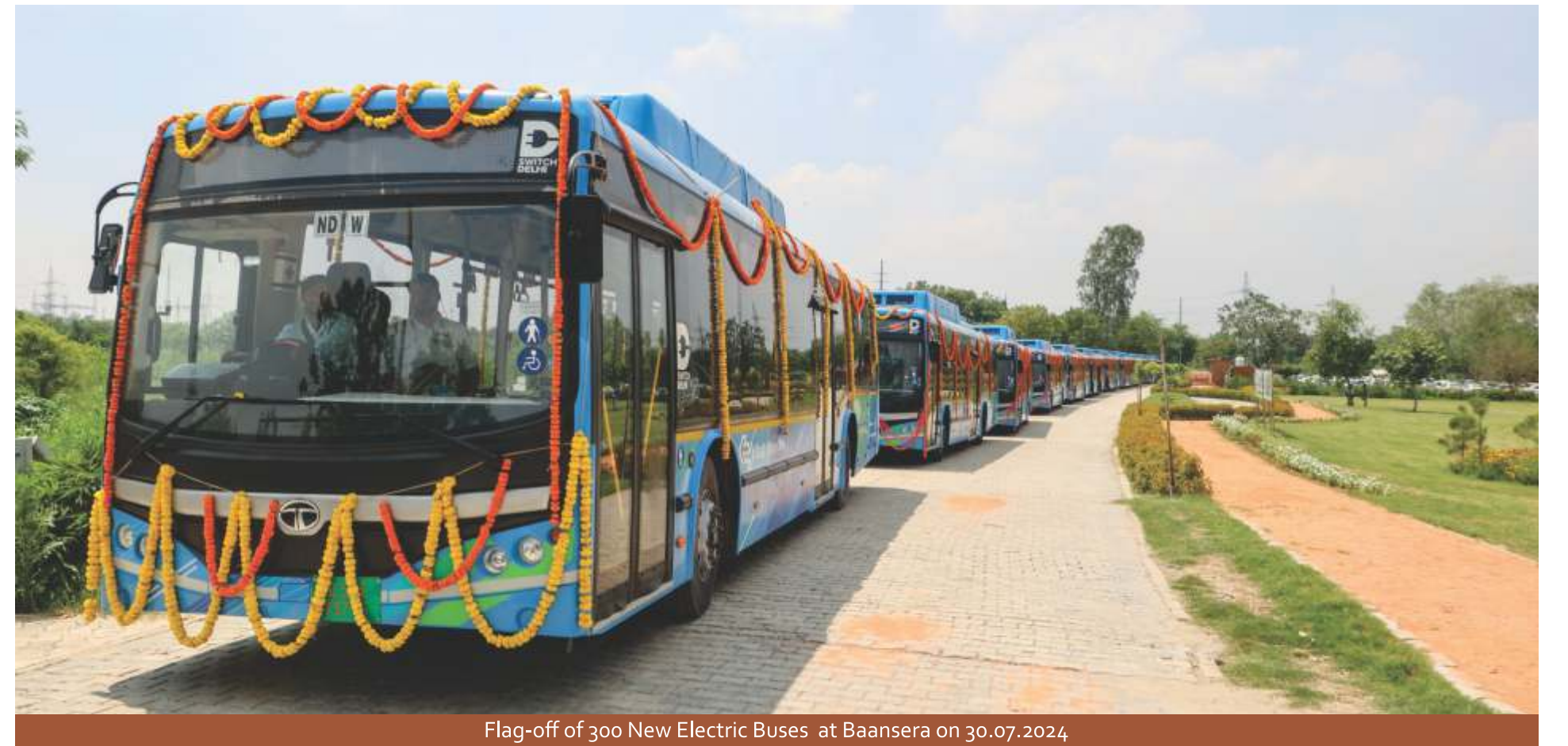
Flag-off of 300 New Electric Buses at Baansera on 30.07.2024