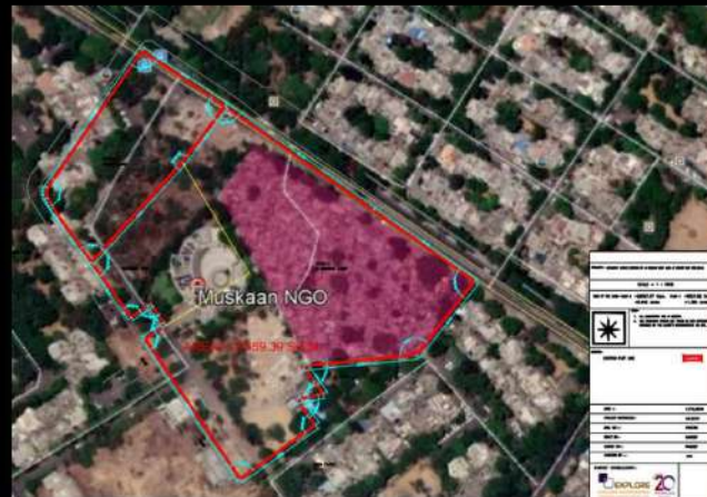
JJ BANDHU CAMP, VASANT KUNJ