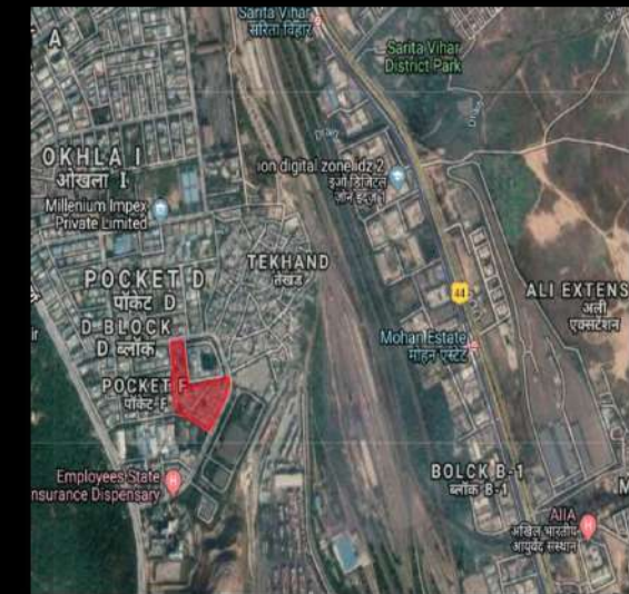
GOLA KUAN, OKHLA-PH1