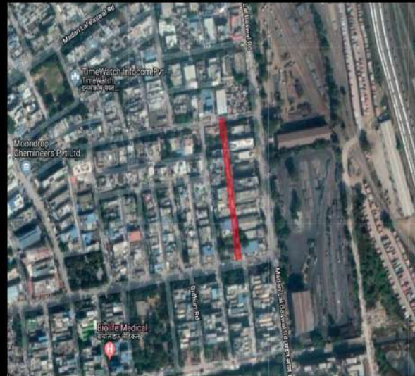
MAJDOOR KALYAN CAMP, OKHLA-PH1