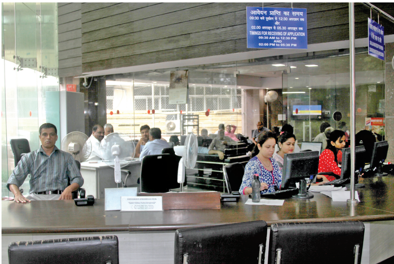
Nagrik Suvidha Kendra at Vikas Sadan

9.1.35 Tie up with ISRO: ISRO has been approached by DDA to develop an application for detection of encroachment on DDA land.