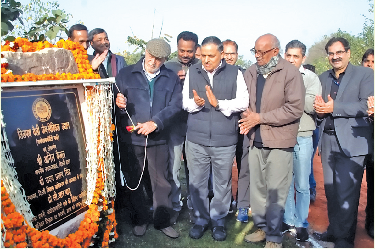
Dedication of Tilpath Valley Biodiversity Park by Shri. Anil Baijal, Hon'ble Lt. Governor of Delhi.