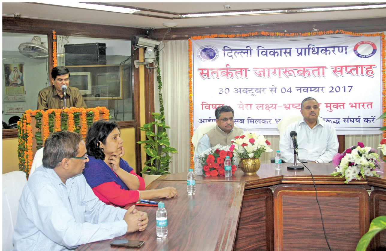
Vigilance Awareness Week