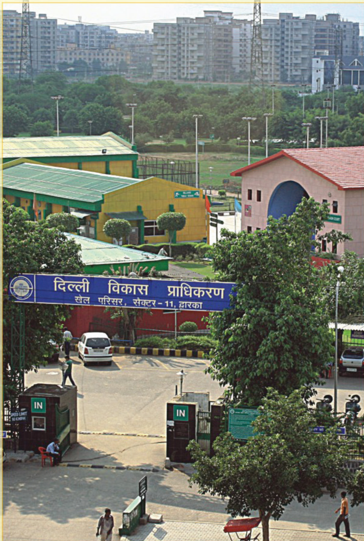
DWARKA SPORTS COMPLEX