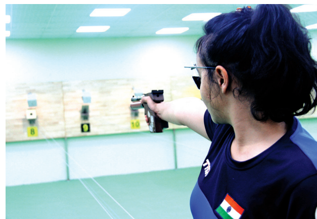
Delhiites playing and enjoying sports at DDA Sports Complexes