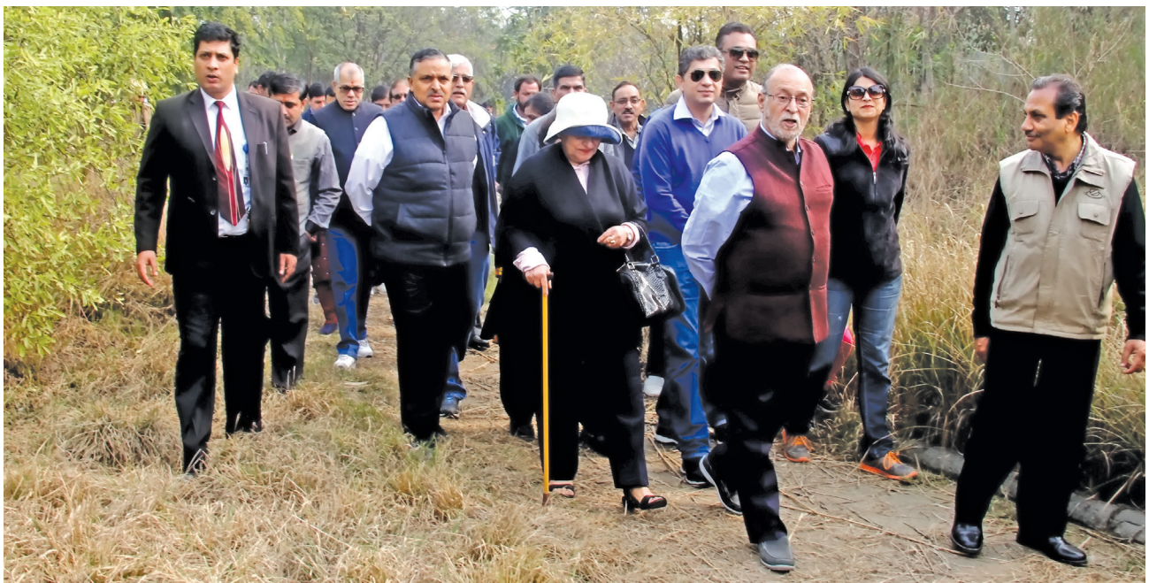
Shri Anil Baijal, Lt. Governor of Delhi going around Tilpath Valley Biodiversity Park