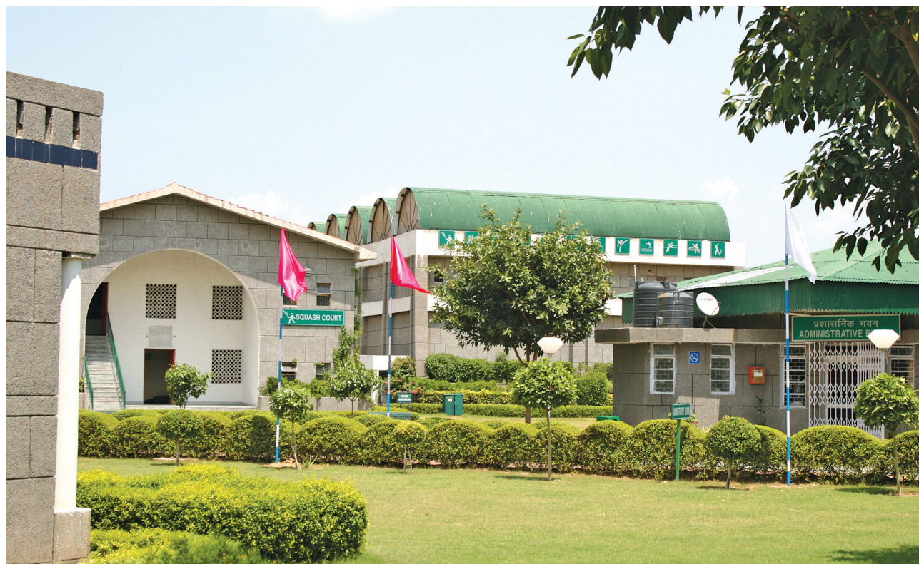
Dwarka Sports Complex, Dwarka