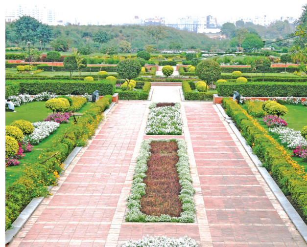
District Park, Jasola