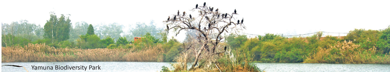
Yamuna Biodiversity Park