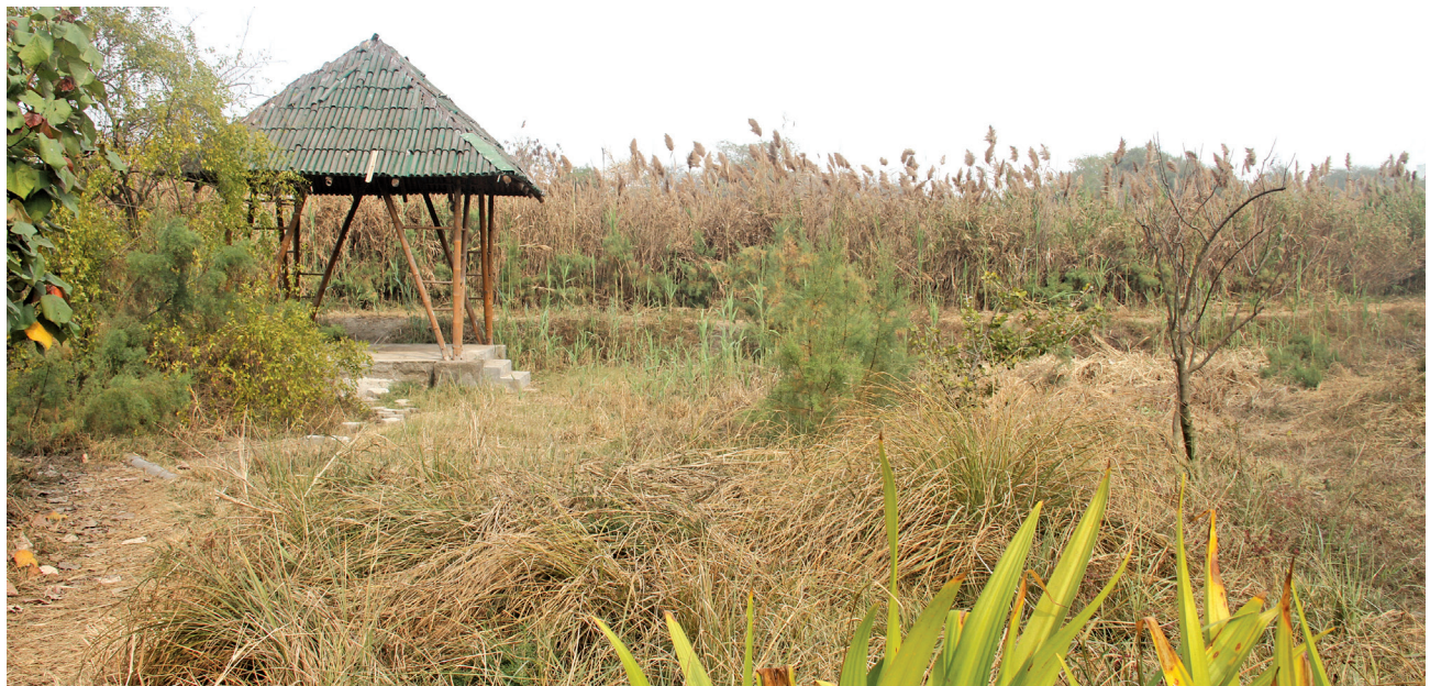
Yamuna Biodiversity Park