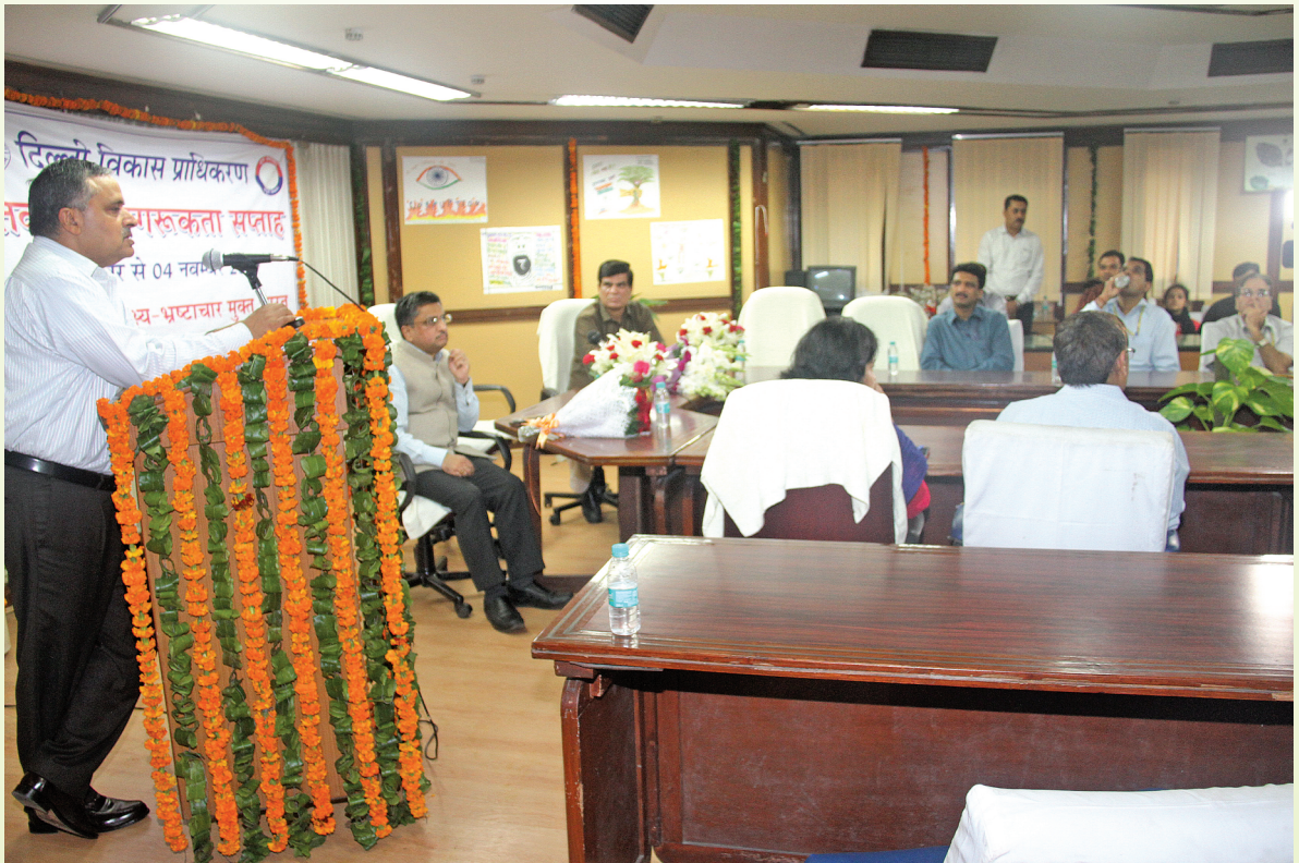
Vigilance Awareness Week