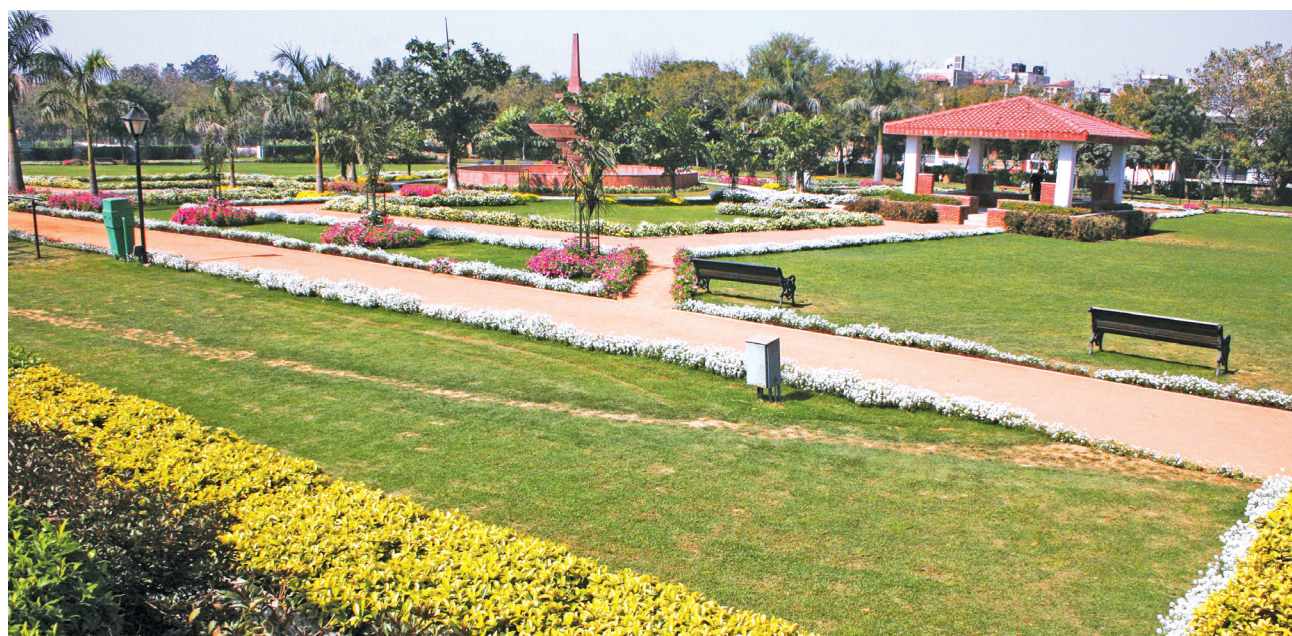
Vasant Vatika, Vasant Kunj

Note: Target could not be achieved due to shortage of water and some other reasons.