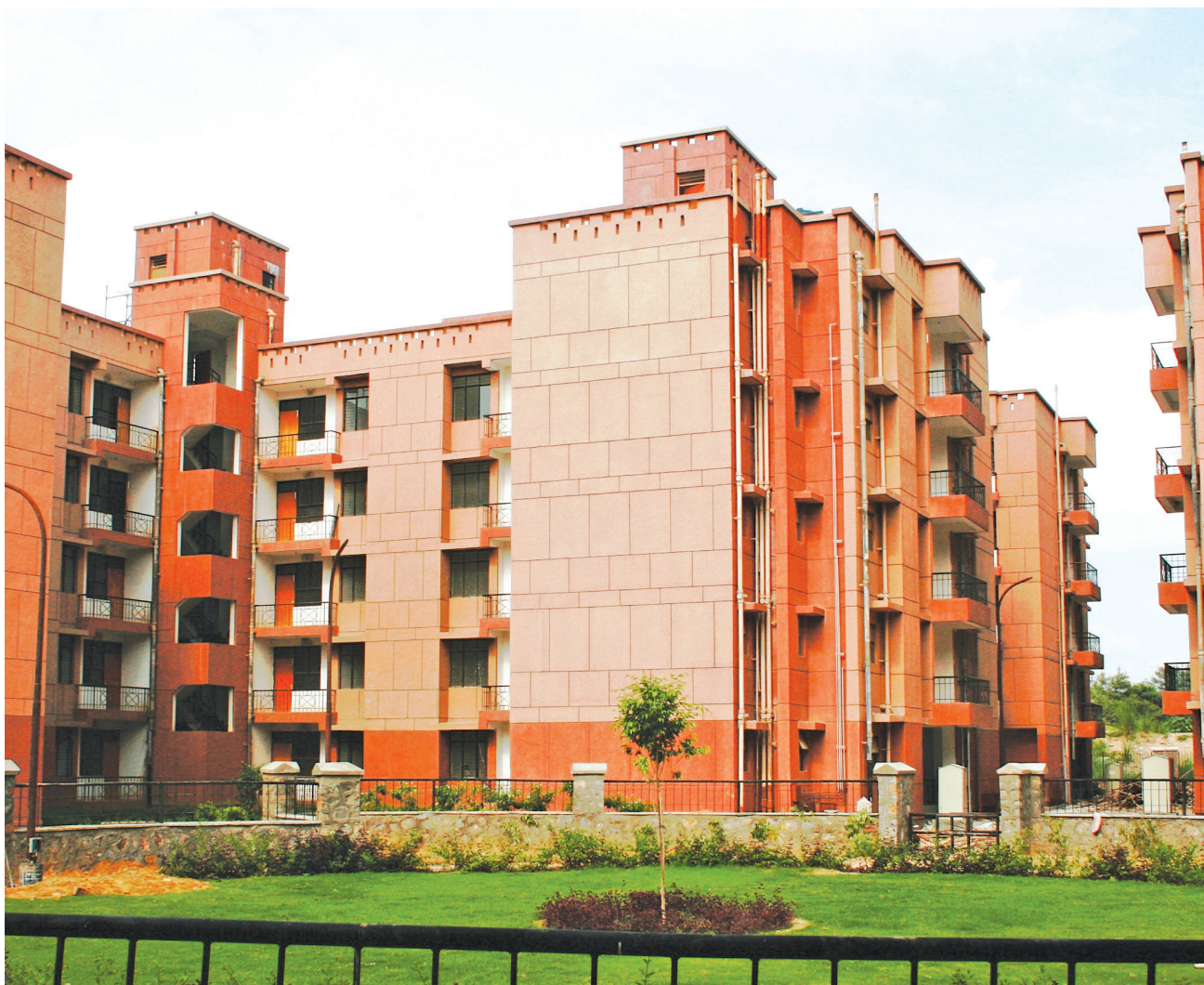
Houses at Vasant Kunj

8.4 Launching of Housing Scheme-2018: DDA is in the process of launching Housing Scheme-2018 for disposal of about 21000 flats of all categories in different localities.