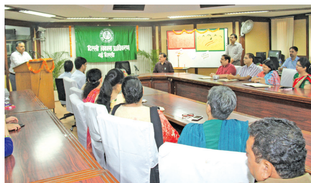
Celebrating Hindi Fortnight

* Out of 1048 total references, 189 duplicate references and 473 online references have not been included.