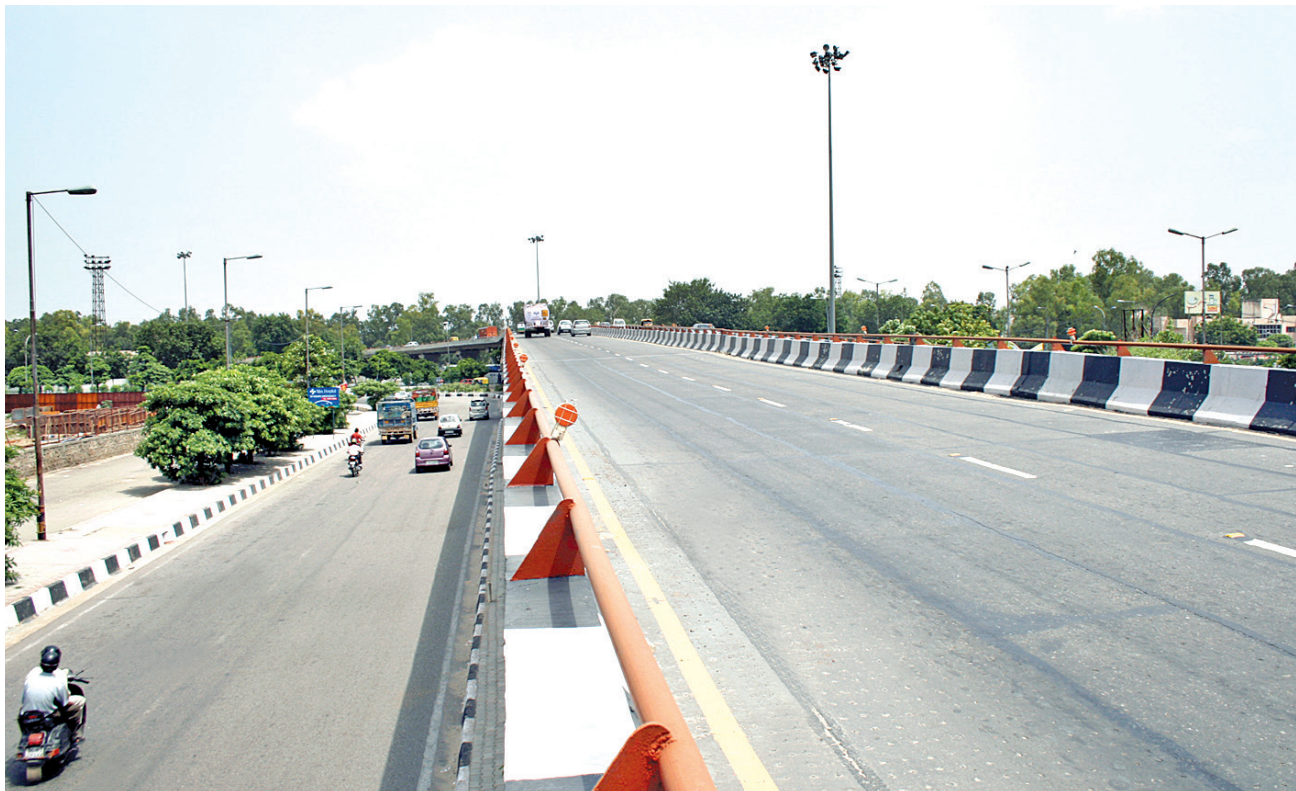
Flyover at Wazirpur Depot